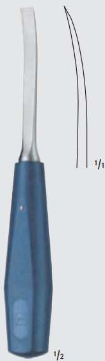
DO751R 10 mm DO753R 15 mm DO755R 20 mm Flachmeißel, gebogen Chisels, curved 200 mm, 8"