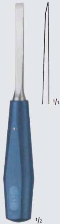
DO750R 10 mm DO752R 15 mm DO754R 20 mm Flachmeißel Chisels 200 mm, 8"