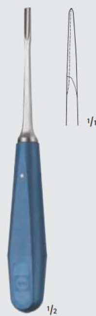
Osteotome Osteotomes 180 mm, 7"